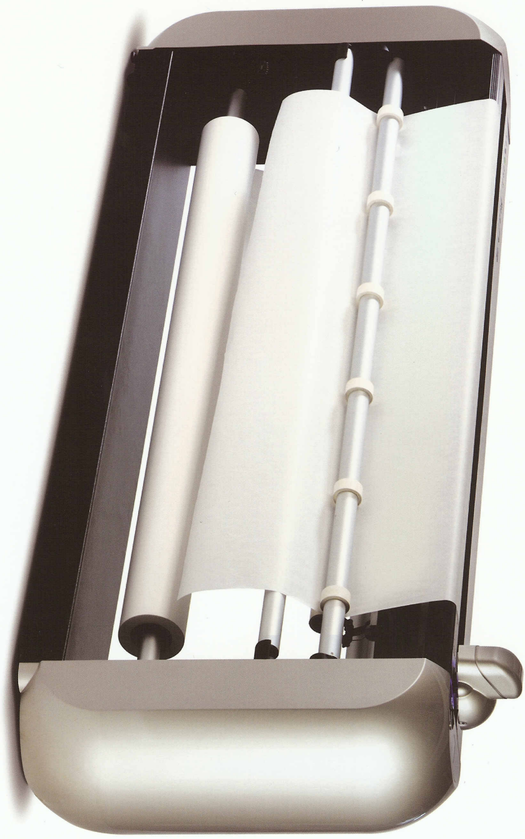
TUNE, the digital plotter for printing cut markers TUNE è il plotter digitale a carta libera per la stampa dei piazzati di taglio